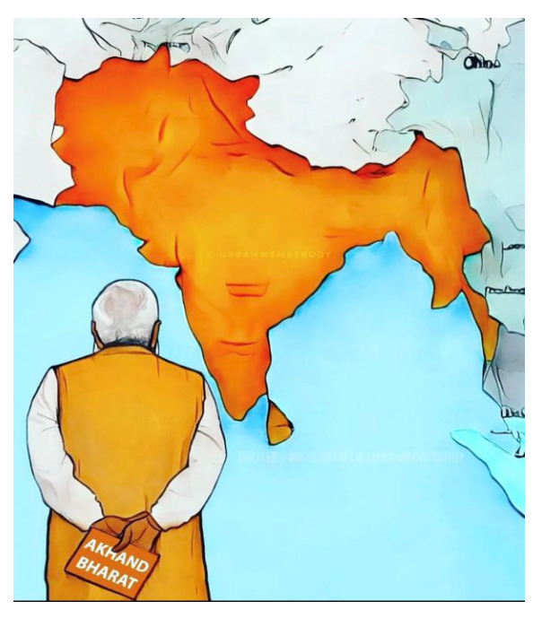
Figure 4. Greater India (Akhand Bharat)