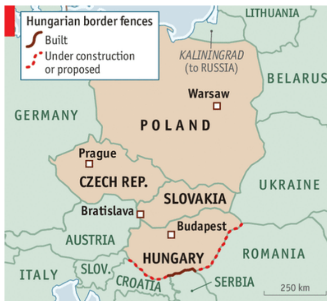
Figure 3: Visegrad 4 Countries and fencing the borders

the 1989 borders and the Iron Curtain were against us, but the current border is for protecting us. Another joint effort to counter the influx of asylum seekers was the formation of the Visegrád Police, which works to assure the ultimate protection of Hungary's borders (Kazharski, 2017, p. 19).